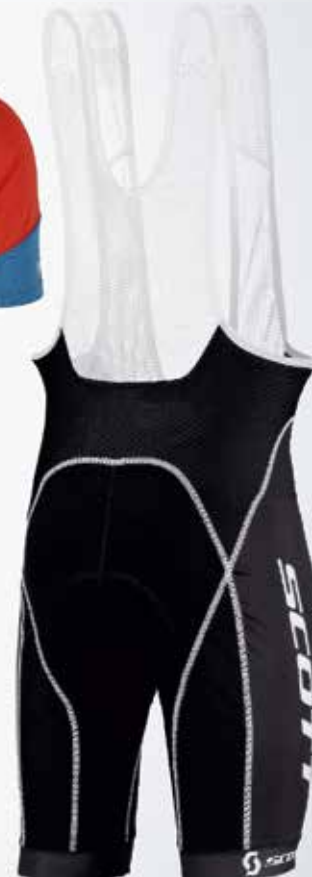
SCOTT ENDURANCE ++ BIBSHORTS