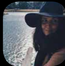
HANNAH COWIE PHOTOS TEXT