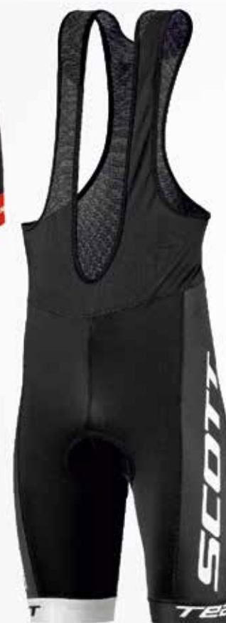
SCOTT RC TEAM ++ BIBSHORTS