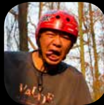
CHEN MIN YING PHOTO