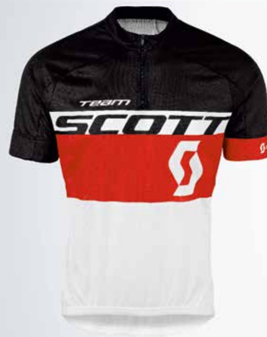
SCOTT RC TEAM SHIRT