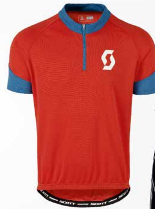
SCOTT ENDURANCE Q-ZIP SHIRT